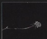
Exhibit: March 6th - April 27th

Reception - Sunday, March 10th, 2024 from 3-5 PM