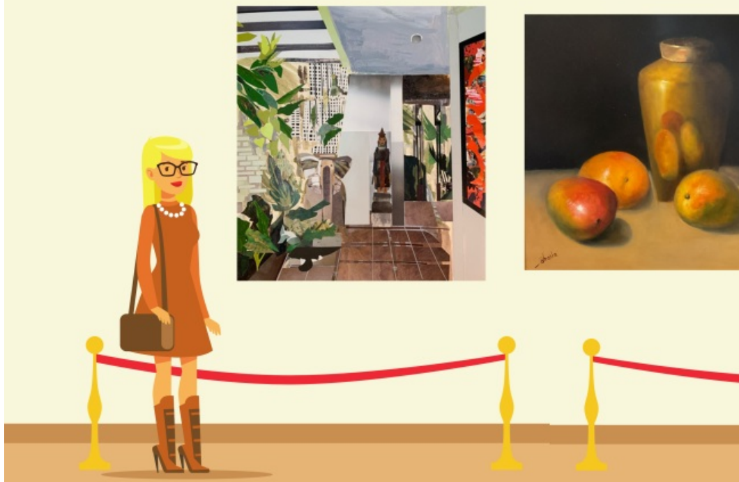
Exhibit: Now until Friday, December 15

Bernice Kish Gallery 10400 Cross Fox Ln, Columbia, MD Open to all!