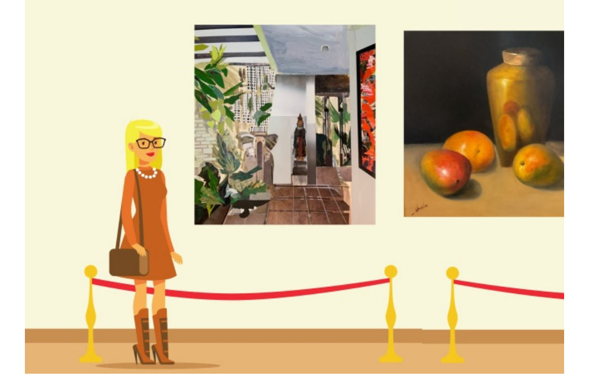
Exhibit: Now until Friday, December 15

Bernice Kish Gallery 10400 Cross Fox Ln, Columbia, MD Open to all!