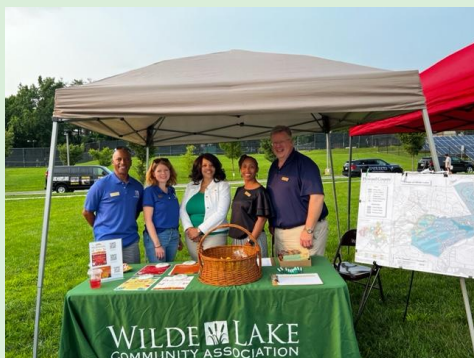
#vibrantwildelake out and about on National Night Out - August 1, 2023